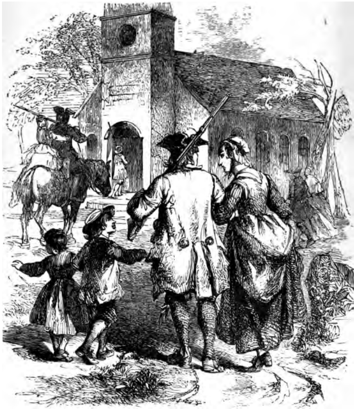
GOING TO DIVINE SERVICE IN THE TIMES OF THE EARLY INDIAN WARS.